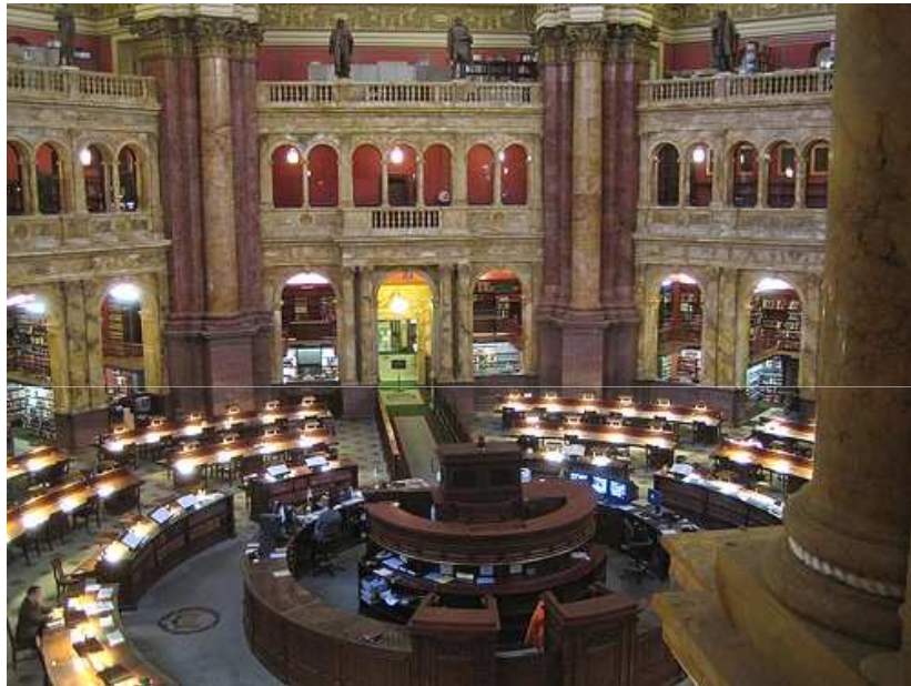
Repositório oficial da Library of Congress